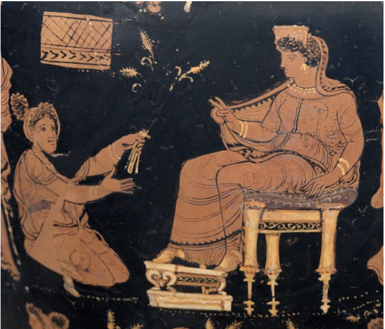
Figure 5. Demeter, enthroned and extending her hand in benediction toward the kneeling Metaneira, who offers the triune wheat that is a recurring symbol of the mysteries. Varrese Painter, red-figure hydria (water jar), ca. 340 BCE, from Apulia.