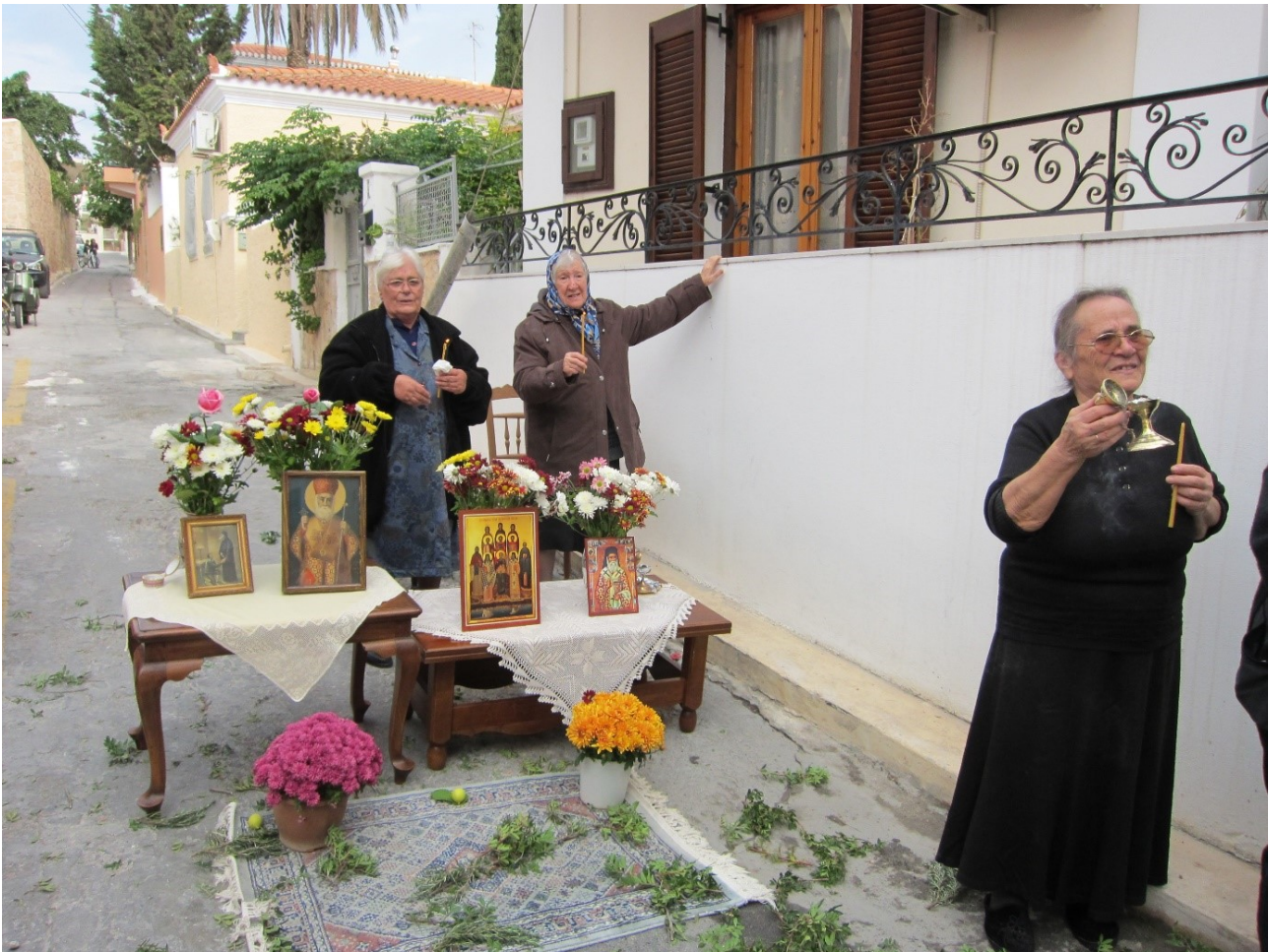
Figure 6. Some house altars awaiting the procession with the head of Agios Nektarios, Aegina, 9 November 2011.