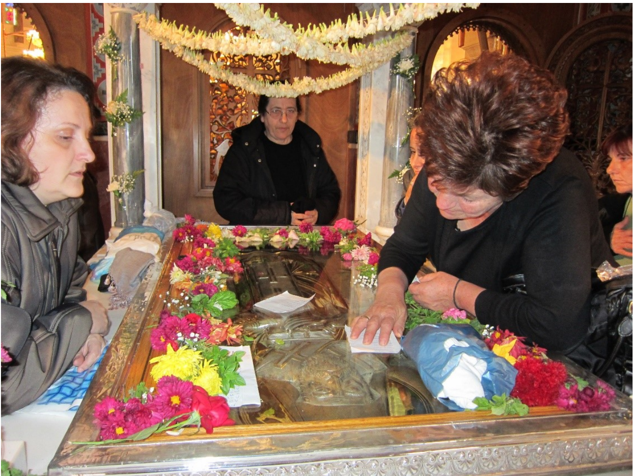
Figure 4. Women venerating the right hand tomb of Agios Nektarios, Aegina, 8 November 2011 (Author’s photograph).