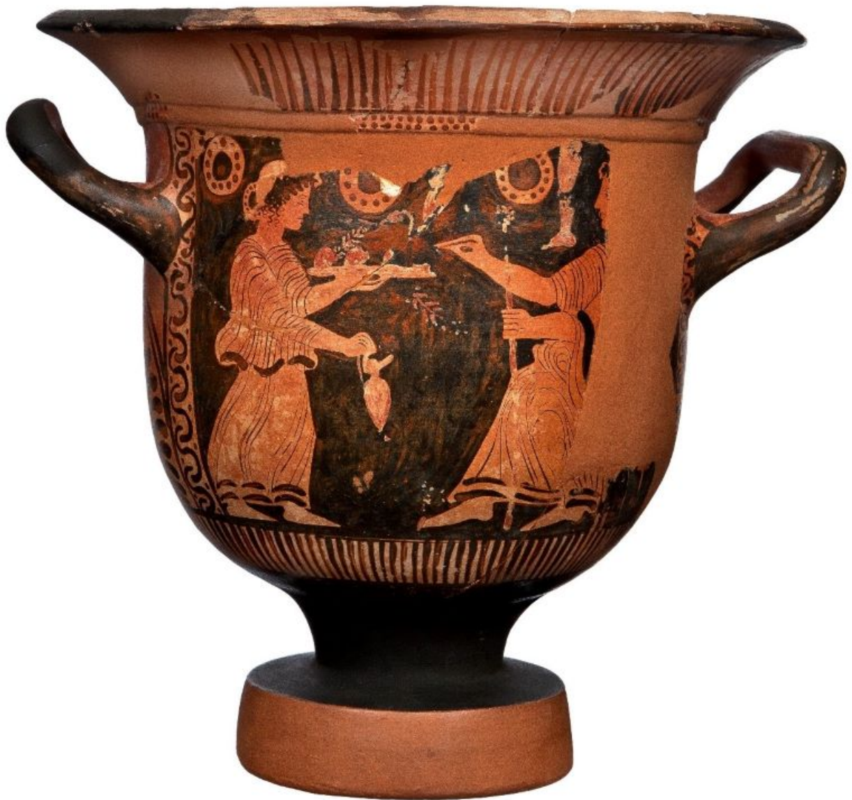
Figure 10. Boeotian red-figured krater (ca. 400 BCE), Athens N.M. (inv. no. 1393) (photograph by Irini Miari). © Hellenic Ministry of Culture and Sports/Hellenic Organization of

The dedication of hair was also common in other healing contexts, such as when women offered locks of their hair or “strips of Babylonian raiment” to the image of Hygieia (Paus. 2.11,6). These women parallel the modern women who dedicate their hair or other personal items to the icon of the Panagia, thus fulfilling their vow to her.