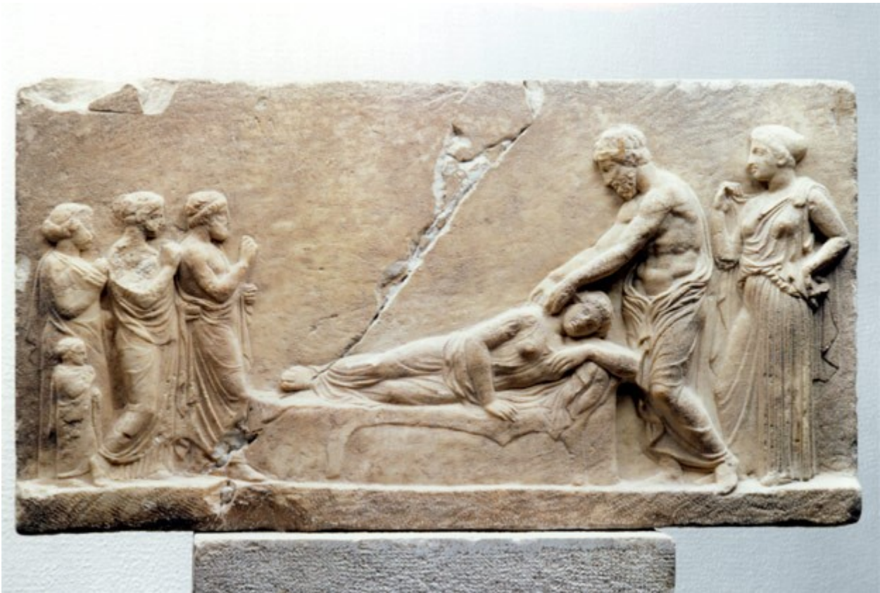
Figure 9. Votive marble relief from the Asklepieion of Piraeus, Archaeological museum of Piraeus, Classical period (inv. no 405). Downloaded 07.04.2019 from http://odysseus.culture.gr/h/4/eh431.jsp?obj_id=4553&mm_id=533